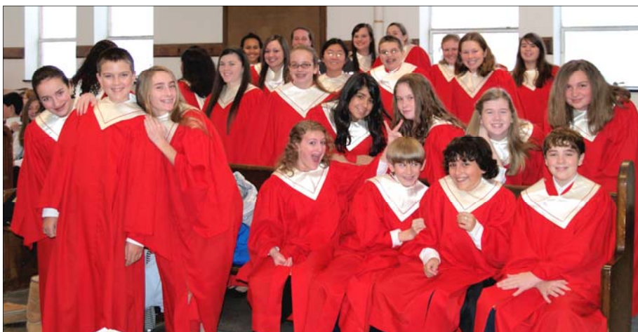
Chorale takes a break from warmups to pose backstage at Most Holy Rosary Church.